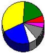
Education - Highest Level Attained