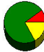
Education - Current Enrollment