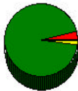
Home Heating Source