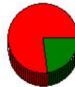
Relationship of Occupant