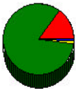
Home Heating Source