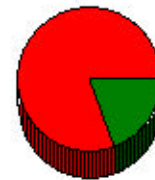
Relationship of Occupant