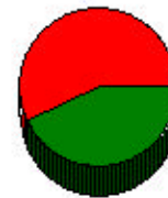
Relationship of Occupant