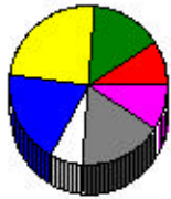
Education - Highest Level Attained