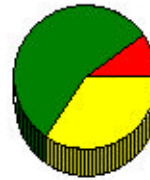
Education - Current Enrollment