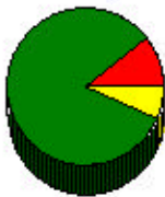
Home Heating Source