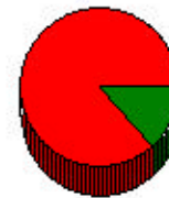
Relationship of Occupant