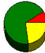
Education - Current Enrollment