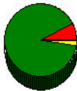
Home Heating Source